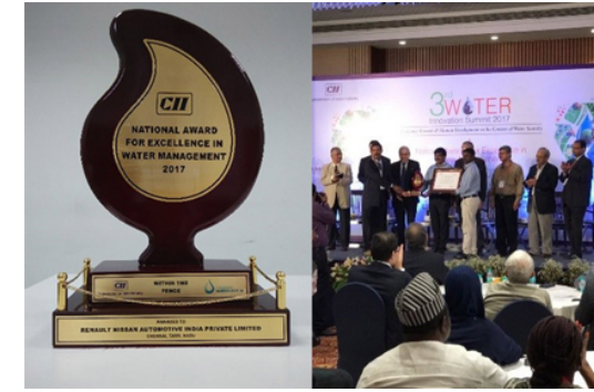
Chennai plant, honored by the Confederation of Indian Industry (CII).

find new ideas for reducing water usage, such as by filtering wastewater from prepainting processes and thus improving water quality. We are also working to reduce water usage at Nissan's Global Headquarters in Yokohama, Japan by processing rainwater and wastewater from kitchens and