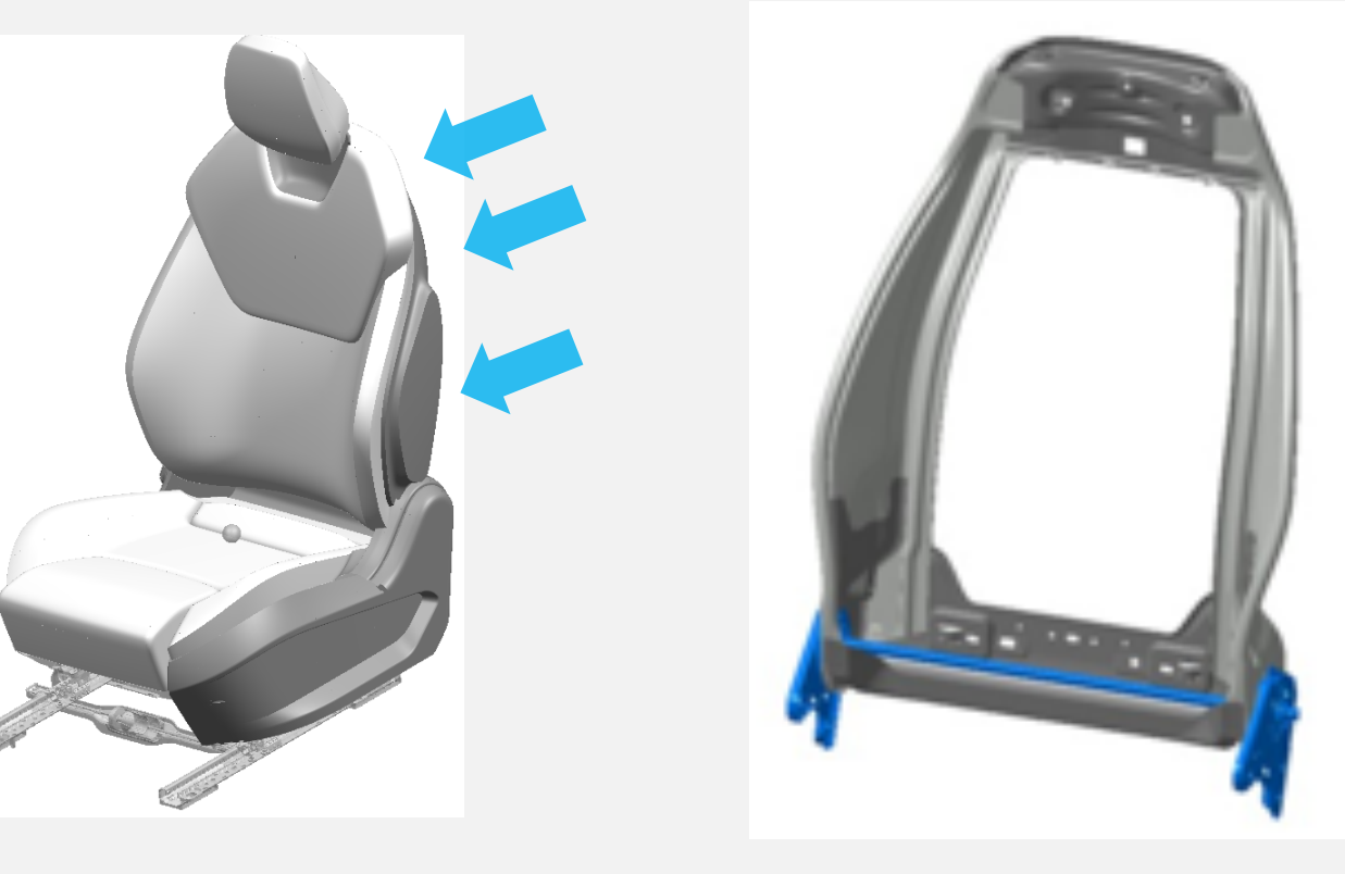
High tensile strength steel back frame