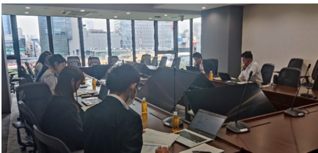
Engagement conducted with the Nissan Motor Workers' Union (October 2024)

In fiscal year 2024, we conducted engagement with the Nissan Motor Workers' Union as an organization representing employees, who are the most important internal stakeholders in human rights activities.