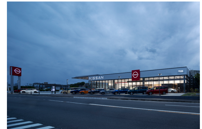
New logo Nissan dealer outlet

Focusing on the voice of each individual customer and quick problem resolution, we implemented QVOC. It is not only a survey but rather a powerful tool to capture customer's feedback with simple questions and free comment. In case a customer shows any concern, QVOC provides the dealer / Nissan a hot alert and allows the dealer to quickly resolve the specific customer's concern and thereby increases customer advocacy for Nissan. It is still one of our important focus initiatives to consistently improve customer satisfaction. At Nissan, we are always thinking of the customer and QVOC is just one of the tools that we use to provide customers unparalleled customer experience.