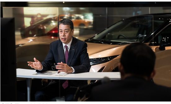
CEO Town Hall Meeting

Employees who participated in such communication events offered comments such as "I was able to obtain necessary information," "top management made an effort to communicate the facts" and "I could feel the sincere enthusiasm of top management."