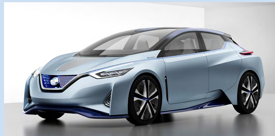
The Nissan IDS Concept