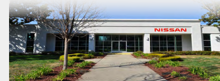
Nissan Research Center Silicon Valley

Integrating the latest in AI technology may help Nissan to build autonomous driving systems that can perform the complex judgments and actions that humans do when they drive. Already, the Nissan IDS Concept vehicle uses AI to process the information collected by its cameras and sensors and put it to work providing a safer, more comfortable autonomous driving experience.