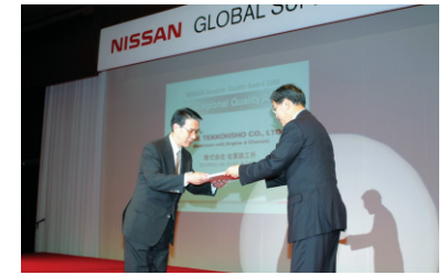
The 2006 Global Supplier Awards ceremony

It is our hope that these awards will inspire partners in our supply chains around the world to adopt management approaches that balance the economic pursuits of quality, lower costs and technological development with consideration for the environment and society.