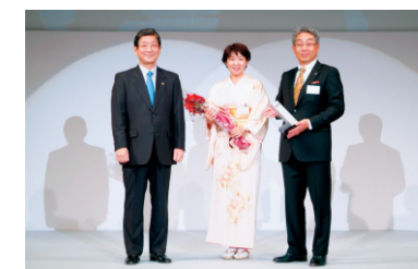
Global NSSW Awards ceremony, 2006

We initiated the Global Nissan Sales and Service Way (NSSW) Awards program to accelerate the improvement of the quality of our service. This program recognizes dealerships around the world that have made substantial contributions to the Nissan brand by achieving outstanding customer satisfaction ratings for sales and service. In 2006, Global NSSW Awards were presented to 49 dealers from 30 countries, of which four were from Japan, 11 from the Americas, 16 from Europe and 18 from the General Overseas Markets.