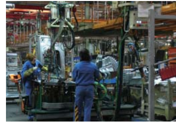
Nissan Motor Ibérica, S.A. (Spain)