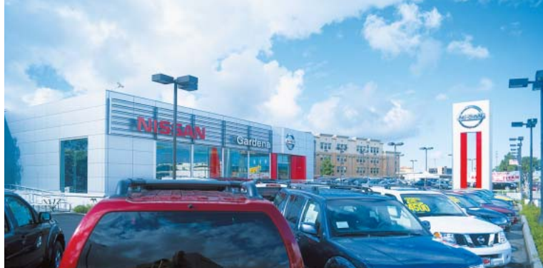
Gardena Nissan, a sales company in California (USA)