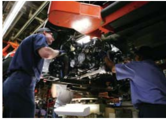
Nissan North America, Inc. Smyrna plant (USA)