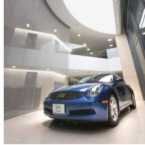
SS Motors, Infiniti dealership (Korea)