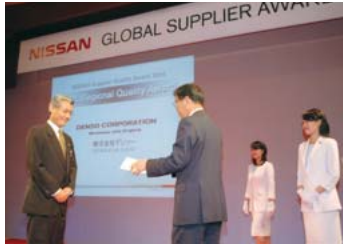
Ceremony of Global Supplier Award 2005