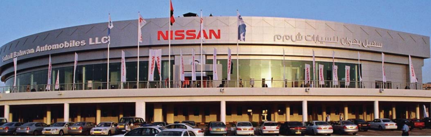
Oman becomes home to world's largest Nissan showroom

on a global scale that properly reflect the Nissan brand. In designing these services, we will keep in mind the cultural conditions and traditions that make requirements different in each area of the world. As an example of this process in action, two years ago in China we announced guidelines promising "five reassurances" in specific areas of car purchase and ownership. Thanks to this finely targeted campaign and our work to make China a leading market in dealership improvement, in 2005 Nissan was rated number one in China in independent customer satisfaction surveys.