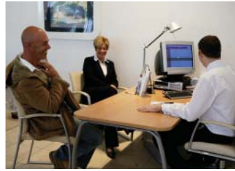
Dealership in the United Kingdom