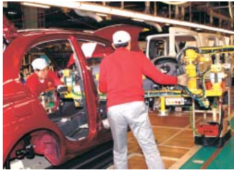
The module production system is being introduced into plants worldwide. (Oppama plant, Japan)