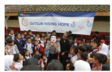
Performers at a Datsun Rising Hope event

In 2015, Nissan launched its Datsun Rising Hope program in Indonesia. In fiscal 2016, the program collected and donated more than 10.000 books and donated them to Indonesian libraries.