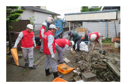
NMK employees assisting with recovery at an earthquake-affected area in Kumamoto Prefecture.

such electric vehicles as the Nissan LEAF and e-NV200, free of charge to affected local authorities and support organizations and assisted with recovery efforts. NMK employees took part in support activities in the stricken area, distributing supplies, helping at evacuation shelters and removing debris. A total of 160 employees participated in the 15 activities.