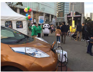
Earth Hour 2017 in Yokohama.

As part of its environmental activities, Nissan has entered a partnership with the international environmental protection body World Wide Fund for Nature (WWF). In Japan, since fiscal 2015 the company has provided one e-NV200 each to WWF Japan partners Tokushima Regional Energy and the Shikoku Institute of Natural History at no cost. Nissan also supported WWF Japan's environmental awareness event, Earth Hour, held in Yokohama in March 2017 by contributing the use of two Nissan LEAFs charged with renewable energy to support the zero-emission management of the event. Elsewhere, Nissan South Africa also donated an SUV to support WWF South Africa activities to preserve headwater areas.