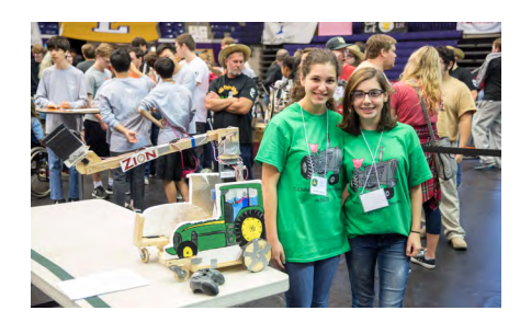
The BEST Robotics Competition in Nashville, Tennessee.

NNA also supported the running of the Lipscomb University/Nissan BisonBot Robotic Summer Camps 2016 at Lipscomb University in Tennessee. A total of 148 students, aged 5 to 16, took part in the camps, studying age-appropriate robotics technologies.