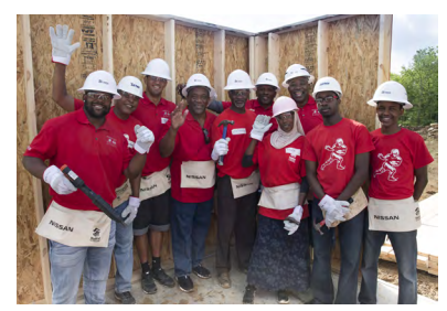
Framing a house with NNA volunteers.

Nissan expanded the partnership in 2012, broadening operations beyond North America to various Asian countries, with Nissan's regional companies conducting construction and hygiene improvement and building disaster-resistant communities. In fiscal 2016, Habitat activities were conducted in the Philippines, Myanmar and Indonesia.