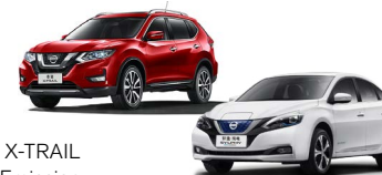
X-TRAIL Sylphy Zero Emission

Total Sales Volume: 1,564 thousand units