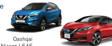
Qashqai Nissan LEAF