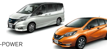
Serena e-POWER Note e-POWER