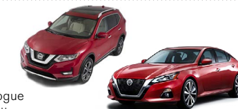
Rogue New Altima

Total Sales Volume: 1,897 thousand units