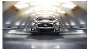
Cover photo: Infiniti Q50