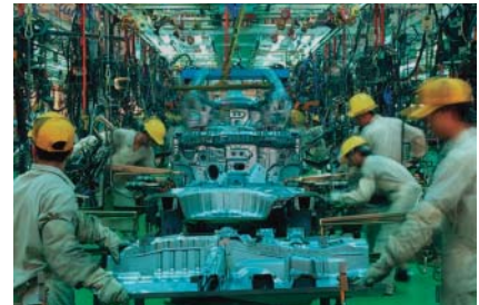
The Dongfeng Motor Co., Ltd. Guangzhou Huadu vehicle plant (China)

With rising demand for Nissan’s products in new markets worldwide, our global growth strategy is focused on the expansion of our regional facilities and investing in greenfield facilities. In the Huadu district of Guangzhou, China, Dongfeng Nissan recently completed a new engine plant, and is in the process of upgrading its vehicle assembly factory to boost productivity. Nissan has established an auto parts export base in Bangkok, Thailand, to ship parts to its manufacturing plants worldwide. We are also constructing a new production facility in St. Petersburg, Russia. In India, Nissan is partnering with Renault and local manufacturer Mahindra & Mahindra to construct a new plant in Chennai, in the state of Tamil Nadu.