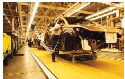
Ergonomic concepts have been incorporated into the production line at the Nissan USA plant in Canton, Mississippi

Thanks to the adoption of ergonomic principles throughout the working environment, NPW enables the creation of production lines that are more “human-friendly” to our employees. Difficult working positions and postures are eliminated from the working process to create a more advanced approach to production. We have taken this approach to a global level, working to improve both efficiency and quality in the manufacture of Nissan automobiles worldwide.