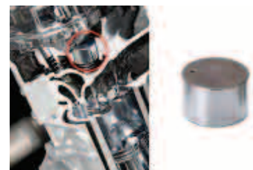
Hydrogen-free DLC valve lifter

Coating the valve lifter with smooth-surfaced hydrogen-free diamond-like carbon, or DLC, has reduced friction by approximately 40 percent and improved practical fuel efficiency.