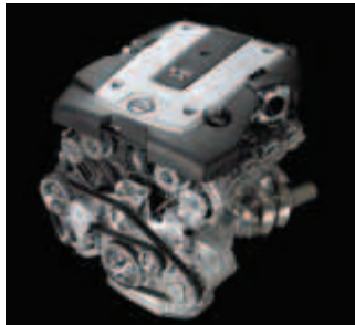
New VQ35HR engine

The VQ35HR and VQ25HR are the two newest engines in the VQ series, developed as part of Nissan's ongoing pursuit of the ultimate in responsive, smooth-revving powerplants. From the time the series debuted in 1994,