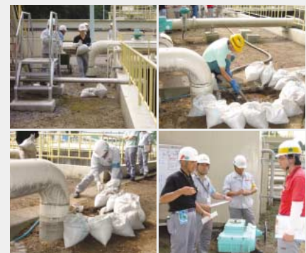
Drills to prepare for environmental accidents Stacking sandbags (above left and below left) Suction of polluted water with vacuum (above right) and status/countermeasures report (below right).

In order to prevent environmental accidents beforehand, and to make the environmental impact minimum when the accident occurs, we have continuously been executing "Environmental education" and "Training for the environmental accident". Employees in the cooperation companies of Nissan have also been given "Environmental education", so that all members working plants can share their experience on the importance of environmental preservation.