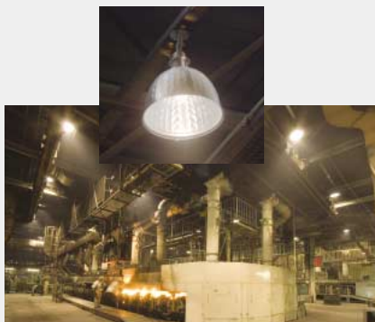
Example of CO 2 reduction efforts: Switching 6,826 lights to energy-saving lights in fiscal 2005.

Furthermore, we continued to nurture awareness of energy savings by means of energy-saving suggestions (1,609 submissions) and energy-saving lectures.