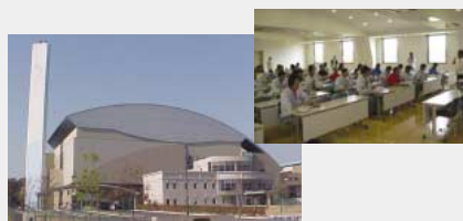
Above: Tour of processing facilities Below: Green Park Mobara

As a part of our efforts to reduce waste and create a brighter, cleaner plant, our employees tour a waste incinerator to learn methods of waste processing. They come to understand the importance of waste segregation by type. That encourages them to segregate waste precisely. The tour leads to less waste.