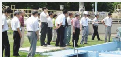
Environmental Facilities Tour

By holding the Tochigi Town and Village Heads meeting, and offering tours to organizations such as the Tochigi Consumer Organization Liaison Council and the citizens of the community, we continue to exchange information with the community for a better understanding of our environmental actions.