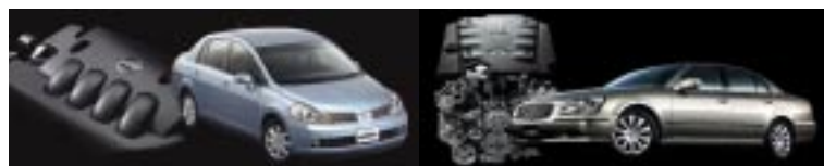
MR18DE Engine (installed in the TIIDA Latio)