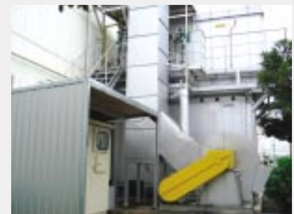
Regenerative Thermal Oxidizer (RTO)

The deodorization equipment that treats emissions from the resin paint plant oven was changed from a catalytic converter to a regenerative thermal oxidizer (RTO), leading to an improvement in the volatile organic compound (VOC) capture efficiency. All paint plant ovens have been changed to RTOs.