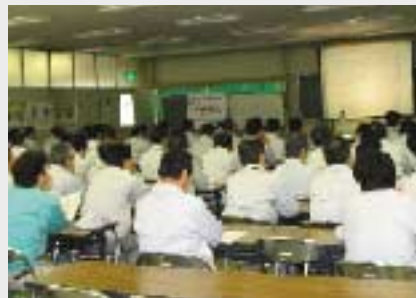
Case Example Competition

February is Energy Conservation Month, and as part of our activities we held a contest where representatives from each department presented on examples of improved energy conservation. The top two groups were nominated for the Kanto Area Case Example Competition of the National Energy Conservation Promotion Competition and one of the groups was honored with the "Superior Energy Conservation Center Award". Starting with the Minister of Foreign Affairs Award, we have been honored with 13 awards in the past 17 years.