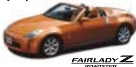
FAIRLADY Z ROADSTER