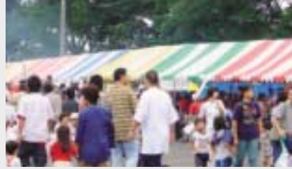
Shirasagi Festival venue

With more than 35,000 participants every year, this festival is our best opportunity to open up lines of communication with the community. We further deepen communication with the community by widely advertising for volunteers to participate in the festival.