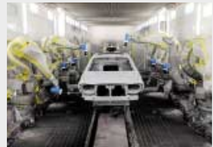
Paint booth utilizing water-based paint

We have reduced volatile organic compounds (VOC) emissions by switching to water-based paint in the painting process. In switching approximately half the painting volume to water-based paint in fiscal year 2004, emissions have decreased by 30%. In the future, we will continue to work to reduce our use of substances with an environmental impact.