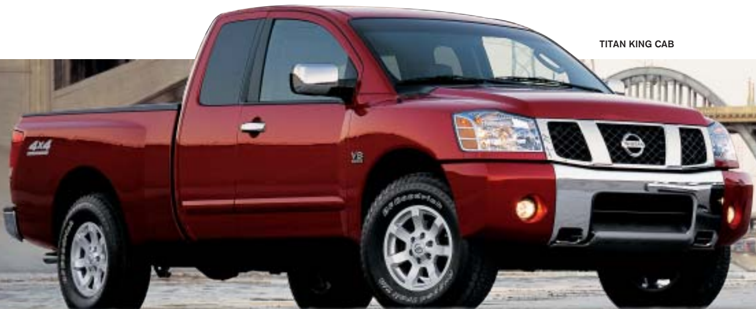
TITAN KING CAB

The opening of the Canton Plant in Mississippi during fiscal year 2003 marked an important milestone in Nissan’s investments in the North American market. The Titan full-size pickup truck, available in