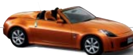
350Z ROADSTER/FAIRLADY Z ROADSTER

in compact dimensions, and have been certified as excellent low-emission vehicles (E-LEVs) by Japan's Ministry of Land, Infrastructure and Transport.