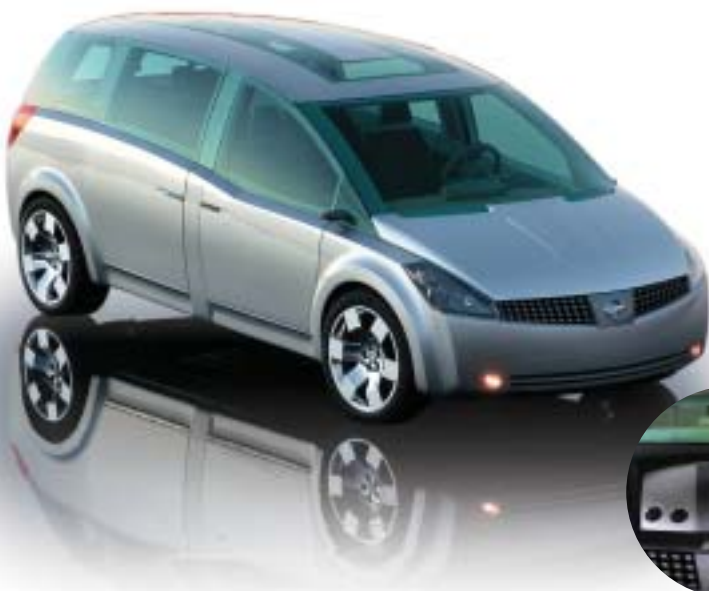
Quest Concept, unveiled at the 2002 North American International Auto Show, Detroit