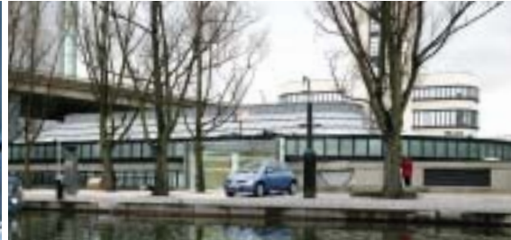
The new Nissan Design Europe, London