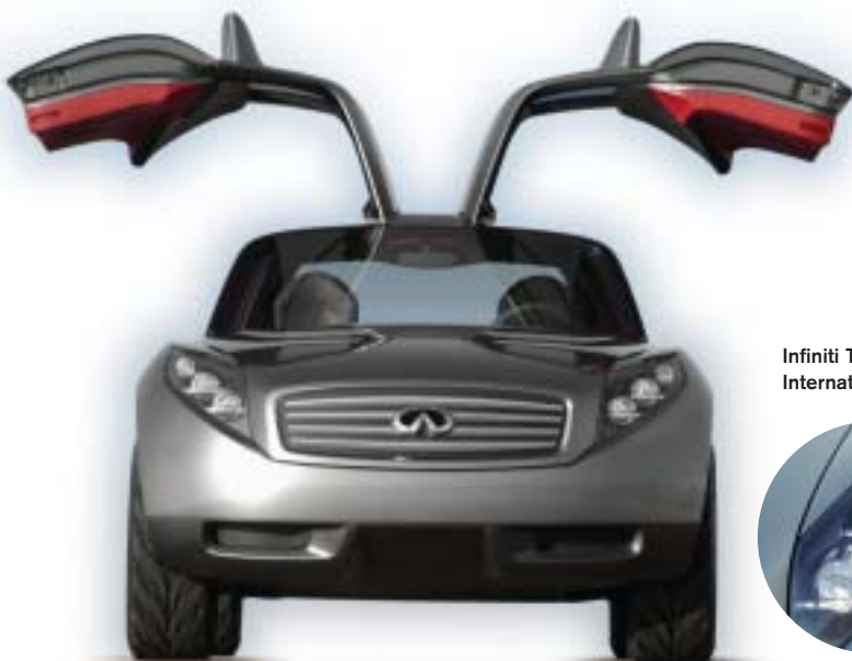
Infiniti Triant concept car, 2003 North American International Auto Show, Detroit

The commitment is straightforward: Nissan design will be a creative force that stirs curiosity, nurtures innovation and challenges the conventional to create attractive, distinctive products.