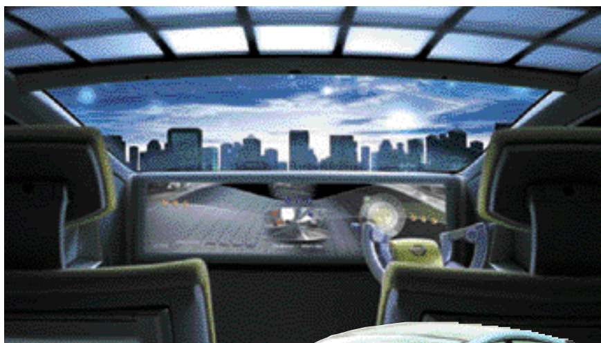
iDeo, a concept car shown at the 2001 Tokyo Motor Show, utilizes interactive communications as part of the search for the ideal networked vehicle

Nissan's commitment to the environment is based on a belief that, as for safety, a real impact can come only when technical solutions are affordable and readily available. This is clear in the wide range of technologies which made possible—and realistic—developments such as the world's cleanest gasoline engine, found in the Bluebird Sylphy and Sentra CA.