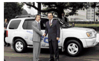
Japanese Prime Minister Junichiro Koizumi and Carlos Ghosn with Nissan's fuel cell vehicle (FCV)

By reaching a level of 80 percent U-LEV vehicles, Nissan will have equaled the realization of 60 percent zero-emission vehicles—still many years to come